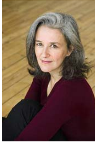
Tatiana de Rosnay